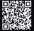
RUT200 360° VIEW

// RUT200 brings the top-rated features of our all-time bestseller RUT240 and is compatible with networks in Asia, CIS, the Middle East, Africa, and South America.